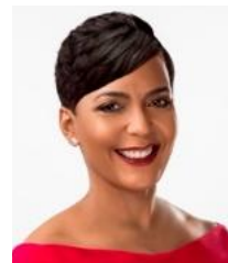
Keisha Lance Bottoms

The Annual Stephanie Tubbs Jones Social Justice Forum presented by DREF at Delta Day's in the Nation's Capital (April 2021) featured conversations with four African-American women mayors, employing the theme "Standing Firm with our Sister Mayors: Creating Solutions to Crises." The following mayors participated: Keisha Lance Bottoms of Atlanta, Sharon Weston Broome of Baton Rouge, LaToya Cantrell of New Orleans, and Vi Lyles of Charlotte.