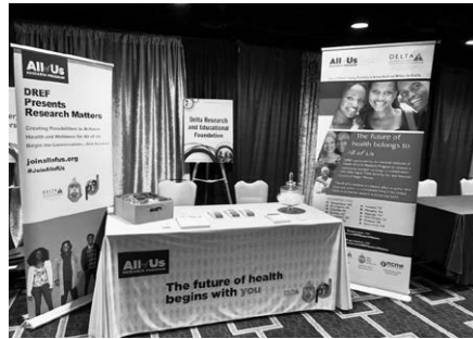
Join the DREF Research Matters Team to conduct outreach at informational displays throughout the nation.

Albuquerque, NM Houston, TX Birmingham, AL Memphis, TN Columbia, SC Nashville, TN Durham, NC New Orleans Greensboro, NC Portland, OR Greenville, SC Sacramento, CA